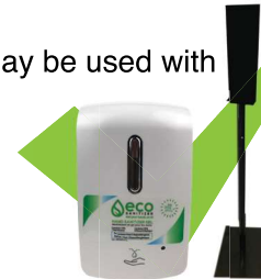
Touch-Free Dispenser Dispenser Stand