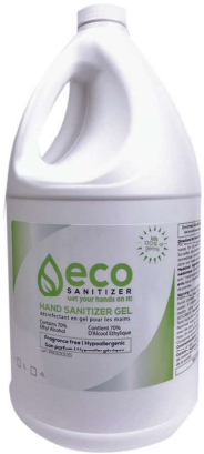
4 L Refill